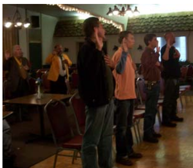
New members take the oath

Membership is vital to our lodge. New members bring in their friends, which means more new members. New faces bring new ideas and energy to the lodge. Members are important to supporting Mooseheart and Moosehaven – the reasons the Moose organization has been around such a long time. You are an important link in this chain.